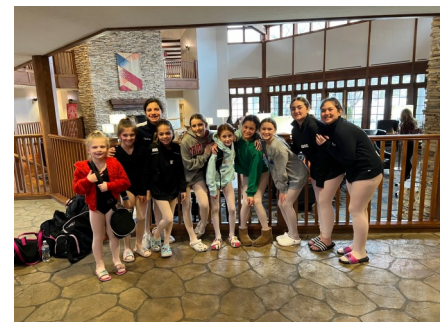
KDGC dancers that attended the ODM Dance Convention in January in Newark.